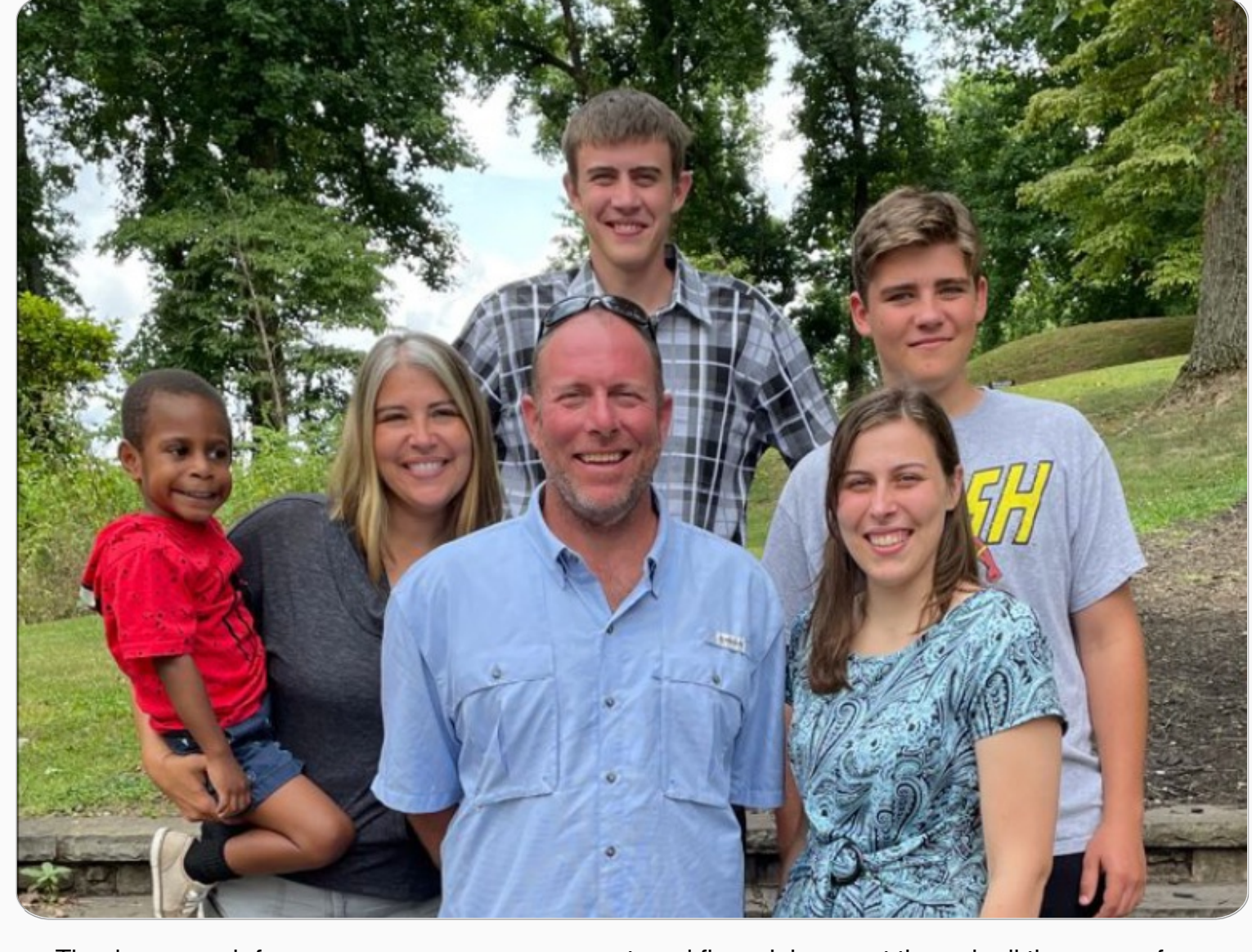
Thanks so much for your prayers, encouragement, and financial support through all the years of our ministry. We could not do it without you. You are so vital to the ministry here. We truly appreciate you all.

Copyright © 2022 Outreach International of Papua New Guinea, All rights reserved.