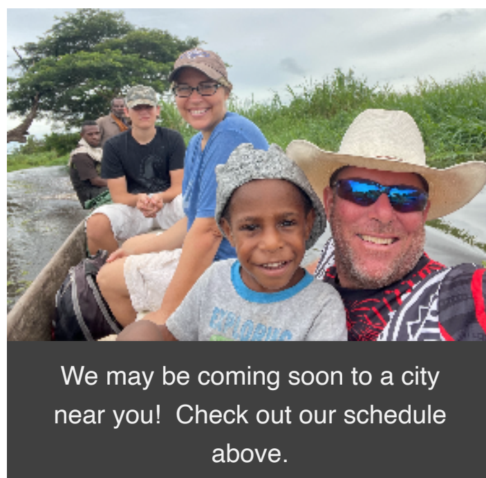
We may be coming soon to a city near you! Check out our schedule above.

My how things have changed in Samban in the last 18 years. It has been so nice to have internet and be able to video call our family back in the USA almost anytime we want. Such a HUGE blessing!