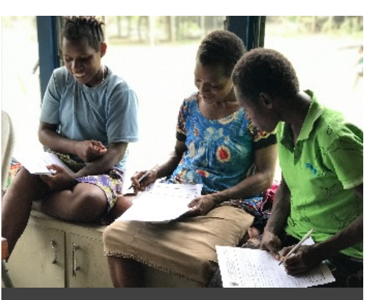
Ap Ma FODE RSC Click on the picture of the three new Ap Ma FODE students

enrolling for 2021 to find out more about our school and the grade 7-12 students who studied with us