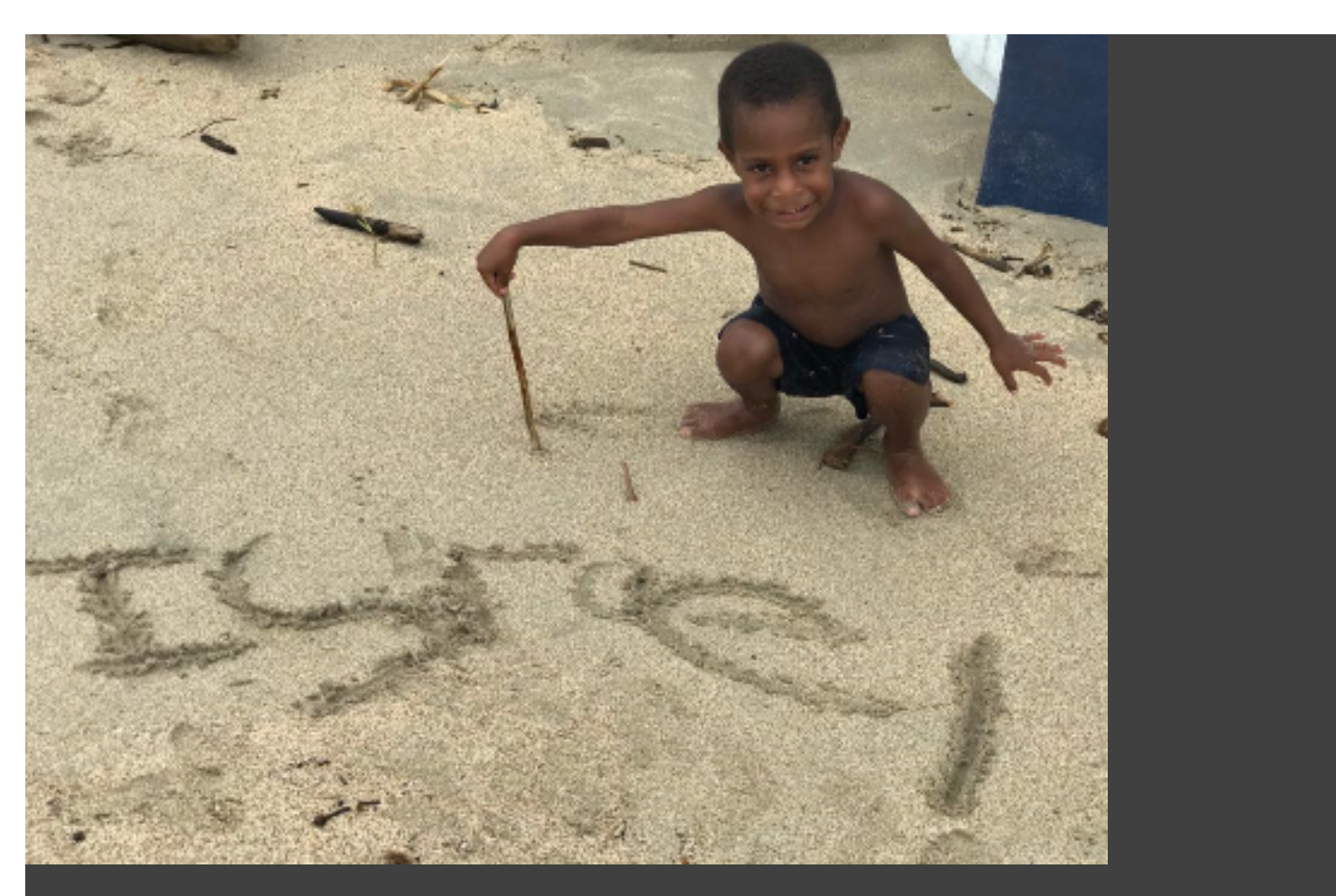
Israel is very proud of being able to learn new things. He's particularly happy about being able to write his own name.