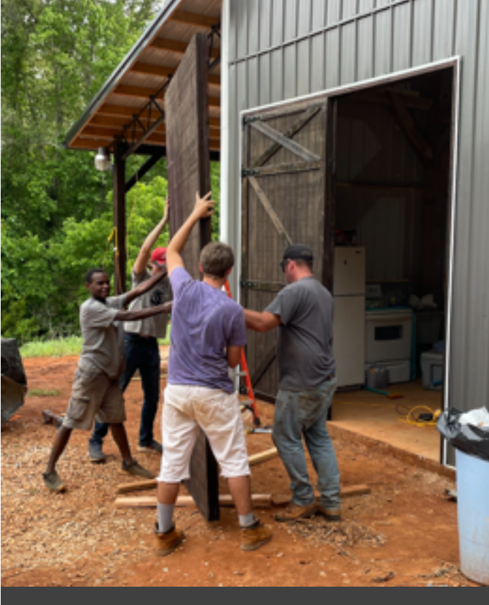
All the boys helped out with the building and hanging of some barn doors. It was good to be working outside instead of riding in the car.