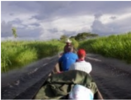
An old picture of the canoe.

A lot of these questions we are going to have to work through over the next few months. The answers we arrive at will affect how we do ministry. It will affect how we live day to day. So please keep our family in your prayers for wisdom, safety, and peace.